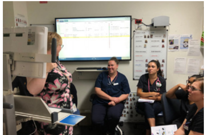
EMR Interactive was well-received at Monash Medical Centre’s Birth Suite

Don’t worry Cranbourne, Kingston, Casey and Moorabbin, you won’t miss out, the interactives will be on their way soon.