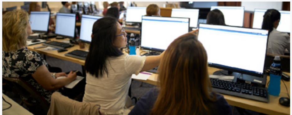
The Training team are continuing their work to ensure you are Go-Live ready

We will be asking about the number of people in your team per day and per shift and planned annual leave dates as well as questions regarding people who may be suitable to be trained as Super Users or Champions.