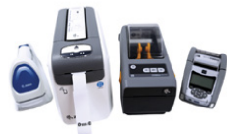
Examples of EMR printer devices and scanner

The devices that have been installed are mostly label printers that will only work when connected to the EMR devices they are paired with. If these have been delivered to your work area or ward, it is fine to switch them off and leave them in a safe place. Please note the devices are