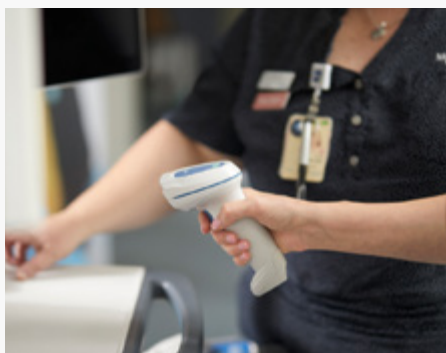
End User testing is an important part of preparing the EMR for Go-Live

There are four key phases of testing the EMR system. One of the final and key parts of testing involves the people who will be using the EMR itself; our people. End User testing involves many of our clinical and non-clinical employees and patients, to ensure the end product will suit the environment it will be used in.