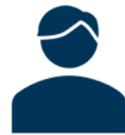
PPE Safety Officer