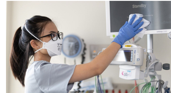
Cleaning clinical equipment – Remember, clean between