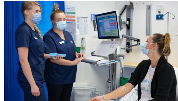
Occupational exposures – Safety first, always