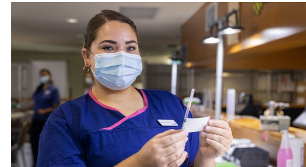
Back to basics - Standard precautions and immunisations