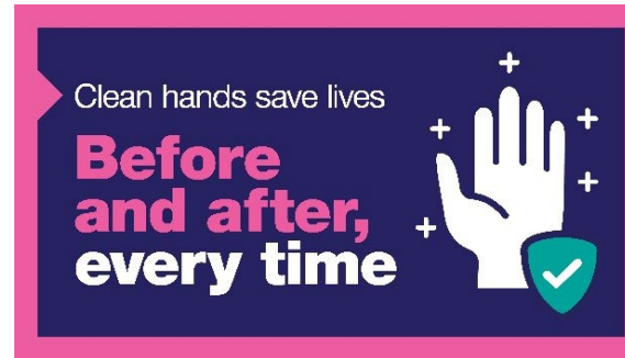
Hand hygiene – Before and after, every time

Keep an eye on iNews for a daily spotlight – today we covered hand hygiene!