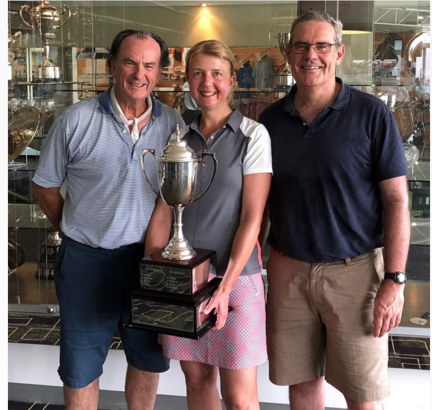
Ophthalmology: Winner of Monash Health SMSA Golf Day 2018